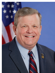
Veteran For Life!

Thank you for your service and sacrifice, and for allowing us to do our part to support your family and team!